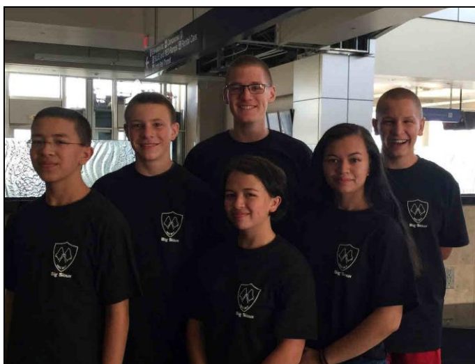
TEAM BIG SIOUX ON THE WAY TO THE 2017 NATIONAL CADET COMPETITION