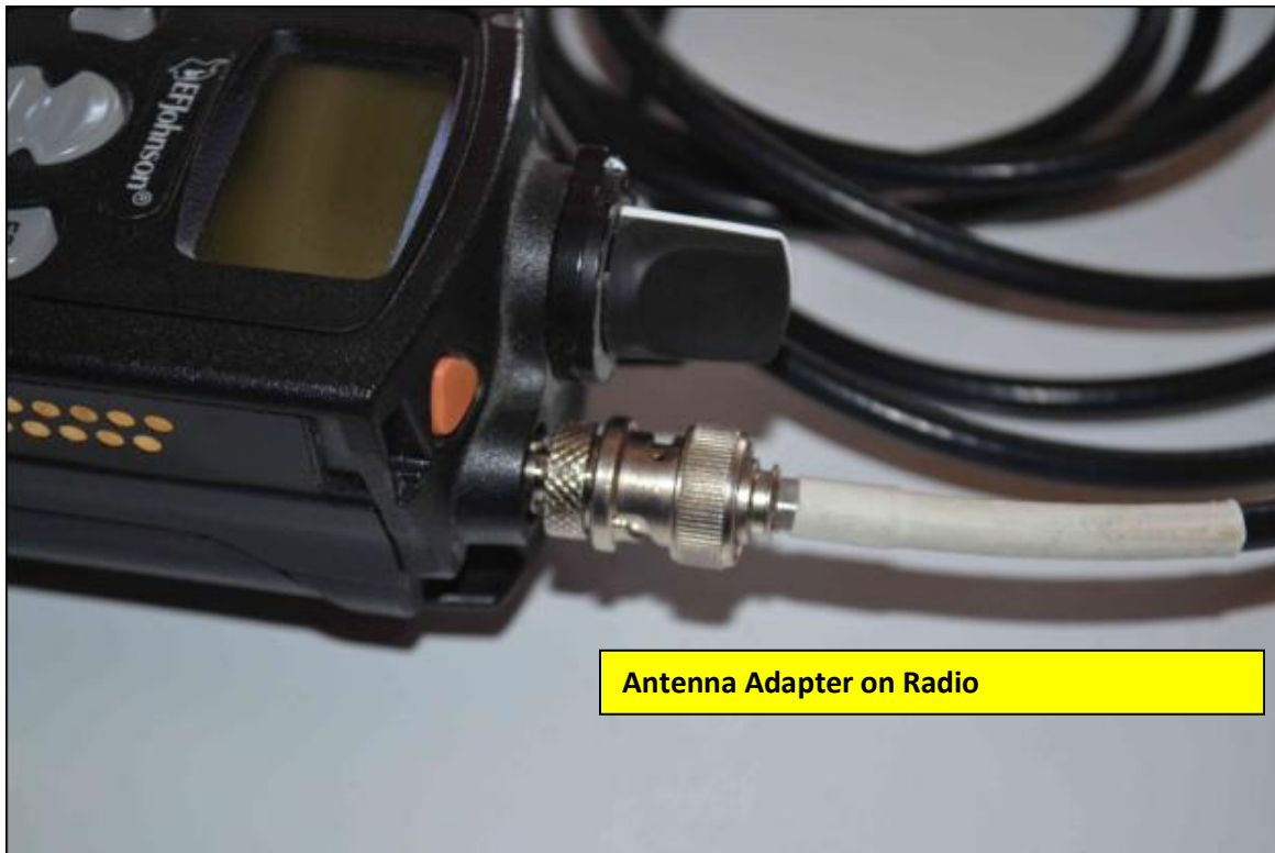
Antenna Adapter on Radio