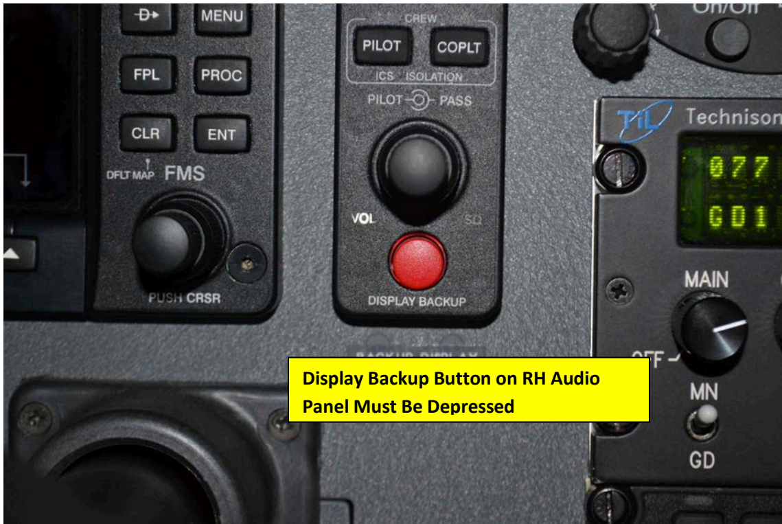
Display Backup Button on RH Audio Panel Must Be Depressed