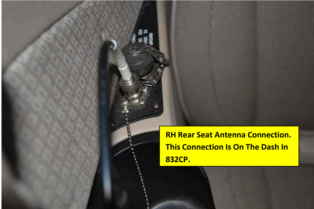
RH Rear Seat Antenna Connection. This Connection Is On The Dash In 832CP.