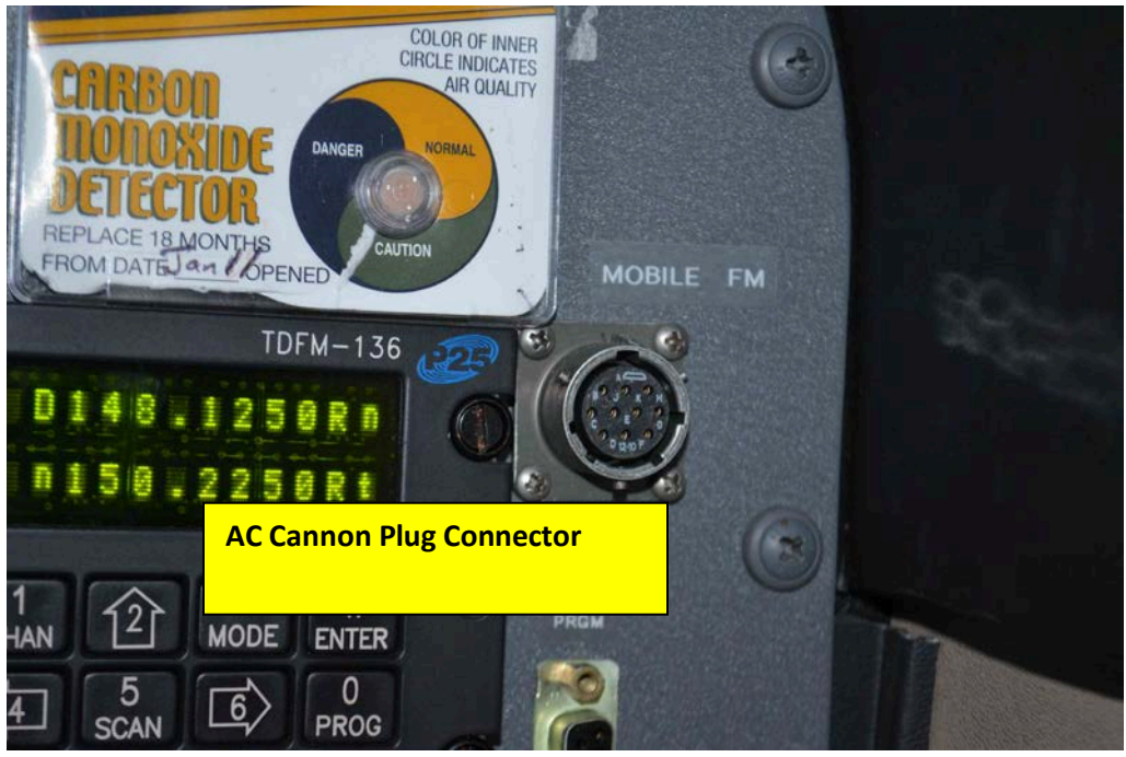
AC Cannon Plug Connector