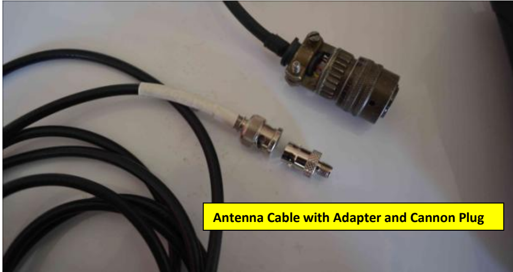
Antenna Cable with Adapter and Cannon Plug