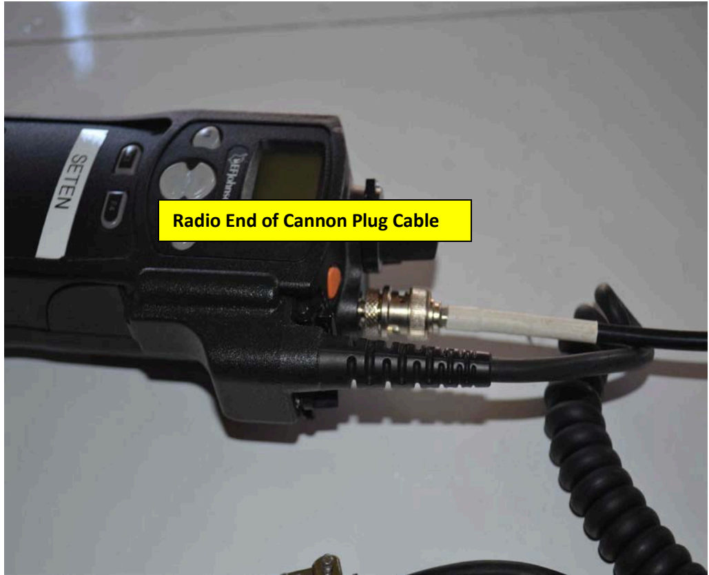
Radio End of Cannon Plug Cable